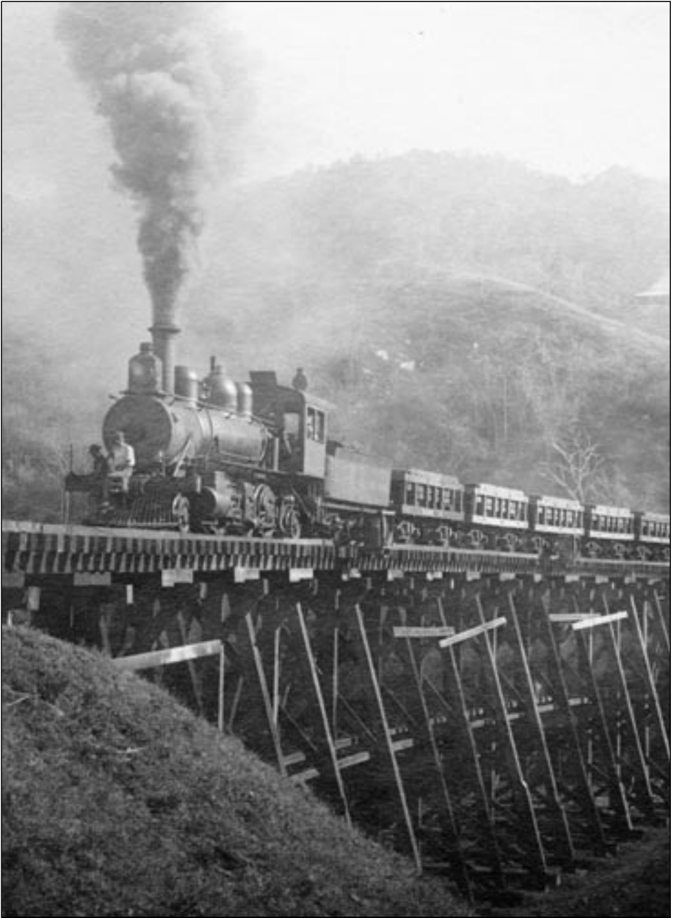
No. 9, a Baldwin-built 2-6-2, pulls ore cars over a trestle on the standard-gauge railroad between Daiquiri Bay and Lola Hill. The nearby Berraco mines were served by 0-4-0 saddle-tank engines that were designed for working in tunnels.