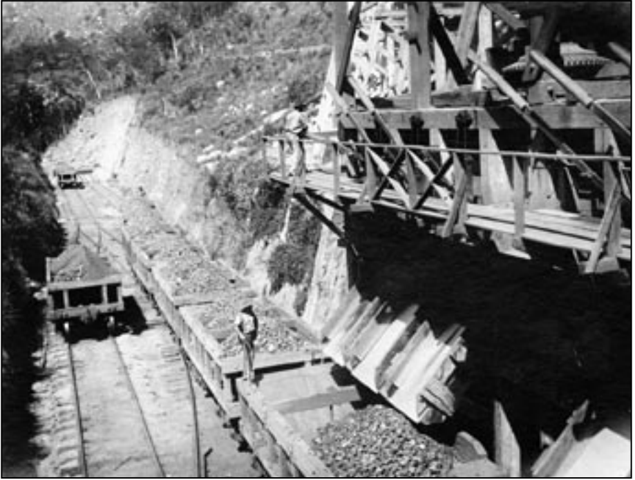
Ore is loaded into railway cars at the bottom of Lola Hill for the short ride (five miles) to the Daiquiri pier and the long ocean journey (1,300 miles) to Sparrows Point.

The economy of the transport system was apparent to the financiers and railroaders who sat on the steel company's board of directors. Between 1902 and 1906, the Spanish-American Iron Co. declared $2 million in cash dividends to Pennsylvania Steel and held another $1.25 million in a surplus account. Even after deducting the capital costs of opening Lola Hill and Berraco, the ore delivered at Sparrows Point averaged 10 percent below the price of domestic ores. 21