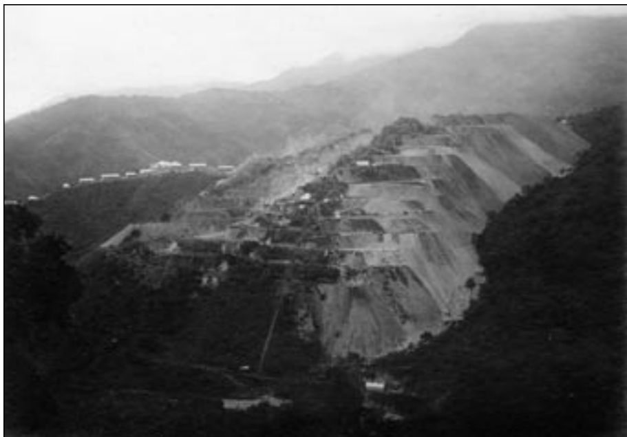
Lola Hill took on the look of a giant corkscrew as it was stripped of its ore. Marion steam shovels worked on the different shelves, removing ore that was blasted out of the rock face by black powder and dynamite. Note the miners' barracks in the distance.

To the backers of Pennsylvania Steel, it was not distance between mine and mill that counted; it was the cost of extraction and freight. With a workforce in Cuba whose wages of $1-a-day were half those of U.S. ore-mine workers, the company could make pig iron at Sparrows Point for less than one-half cent per pound.