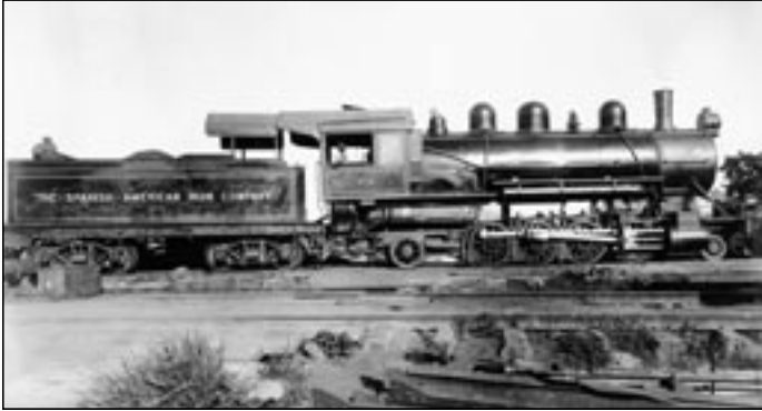
Ore trains that were assembled at the bottom of the incline at Piedra Gorda were hauled by No. 60 to the drying kilns and steamship docks at Felton on the Atlantic Ocean.

than 0.5 percent. The bridges, designed by PRR's engineering department, were constructed of steel. As a general rule, 30 loaded ore cars were hauled to Felton by No. 60, a 2-8-2 Mikado, although trains of 45 cars were sometimes operated. 26