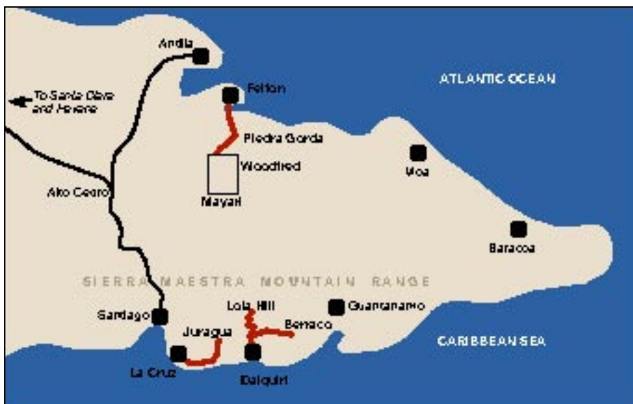
Three iron mining districts were developed in Cuba between 1882 and 1910—Juragua and Daiquiri on the south coast and Mayari on the north coast. The red lines show the railroads that linked the mines to ports, and the black lines represent the Cuba Railroad.