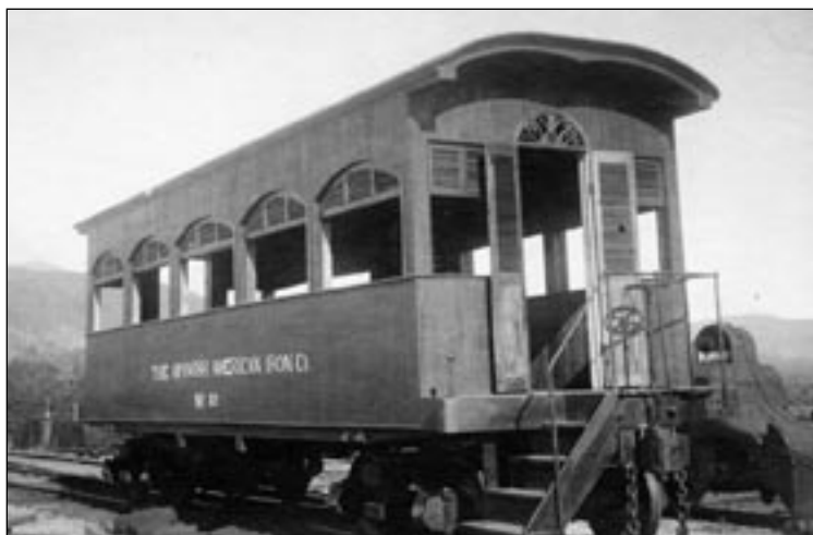
With no more than bridle paths for local roads, this open-air car was used to transport officials to the mines.

8. The company initially claimed 750 hectares (1,852 acres), but eventually the claim expanded to 10,000 acres and 11 mines.