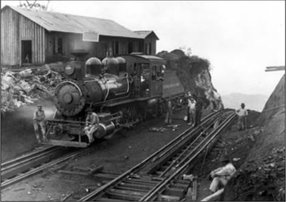
Railroad workers pose with No. 55, a Baldwin 0-6-0, at the summit of the incline at Woodfred. Dropping 1,500 vertical feet on the incline, the ore cars were controlled by a barney car that was attached to a steel cable. The descent took 12 minutes.